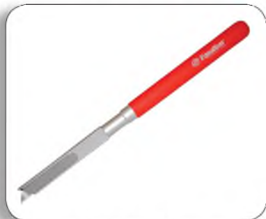
Adjustable Long Knife • Page 64