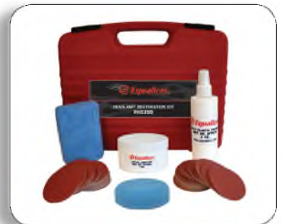
Headlamp Restoration Kit • Page 155