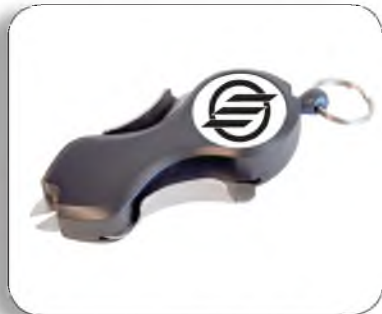
Pocket Line Cutter • Page 50