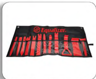
PryDaddy ™ Tool Kit • Page 116