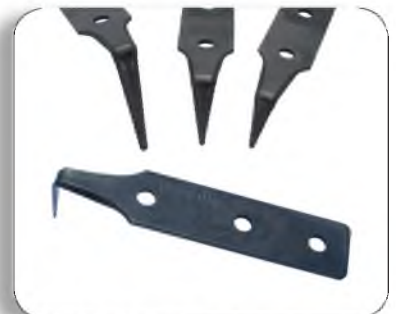
UltraWiz ® Serrated Blades • Page 61