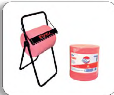
WypAll ® Dispenser & Towels • Page 161