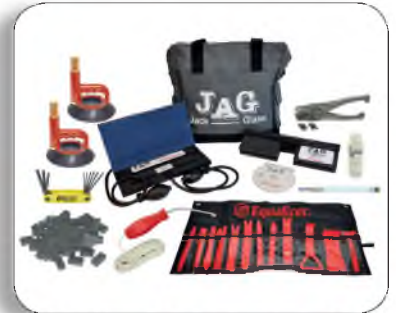
Specialty Flat Glass/Glazing Kit Upgrade • Page 136