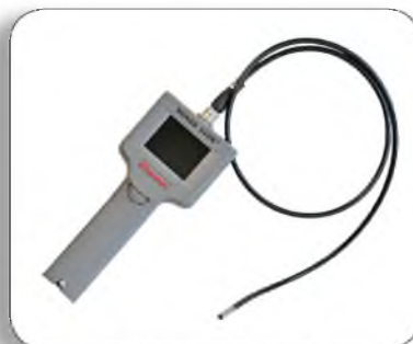
Snake Eyes ™ • Page 19