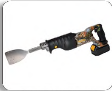
Equalizer ® Ambush ™ • Page 8