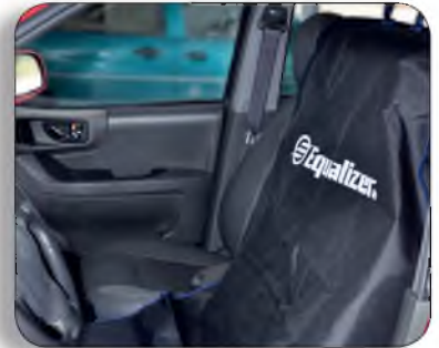
Nylon Seat Protector • Page 164