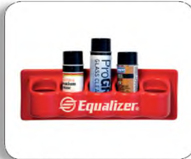
Can Organizer • Page 141