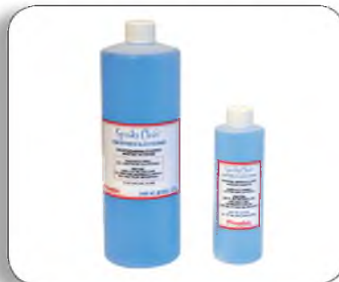
Squeaky Clean ™ Glass Cleaner • Page 160