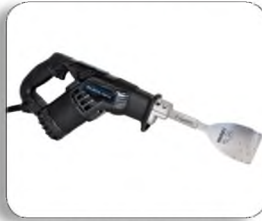
Equalizer ® Black-Ops ™ • Page 16