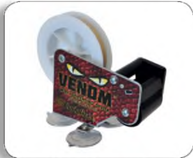
Venom ™ Wire Dispenser • Page 51