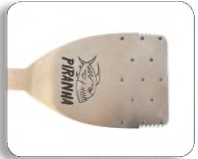
Piranha Blades • Page 27